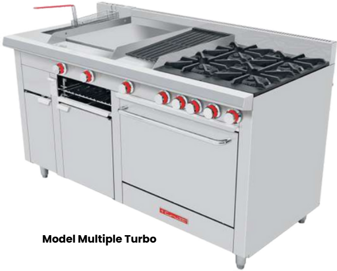
Model Multiple Turbo

The images presented here are illustrative and may vary or not exactly match the physical product.