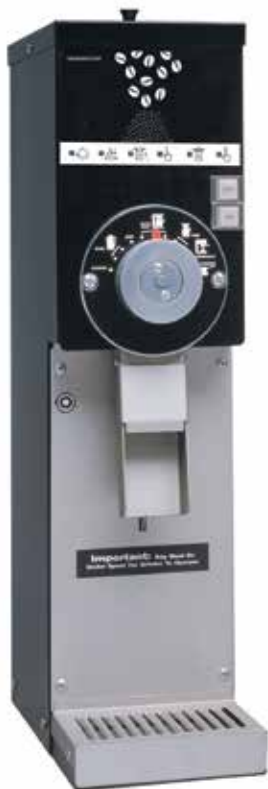
model 875S (875-BS)