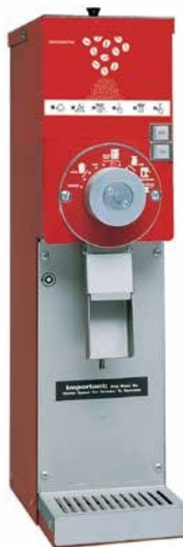
model 875S (875-RS)